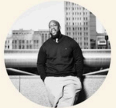
Asa Randolph Advisory Council