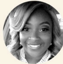
Crystal Ford Advisory Council