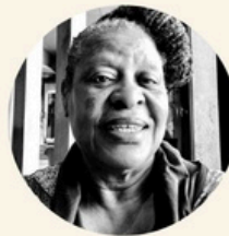
Eartha Walls Advisory Council